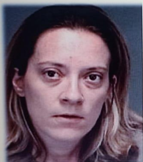
1 AGE: 33