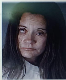
3 AGE: 39