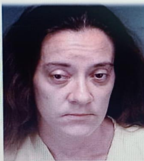
2 AGE: 37